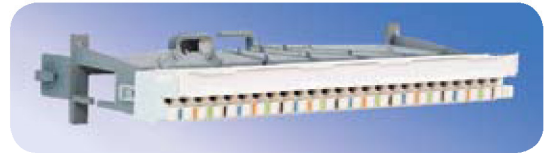
HighBand® 25 label holder (shown mounted on block)