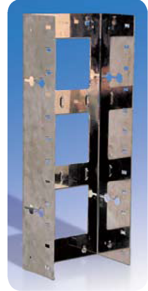
HighBand® 25 back mount frame

Complete 300-pair HighBand® 25 system includes back mount frame and HighBand 25 blocks with rear cable managers, patch cords, cable management rings and covers (single on left side, dual on right side) and a cable trough added below