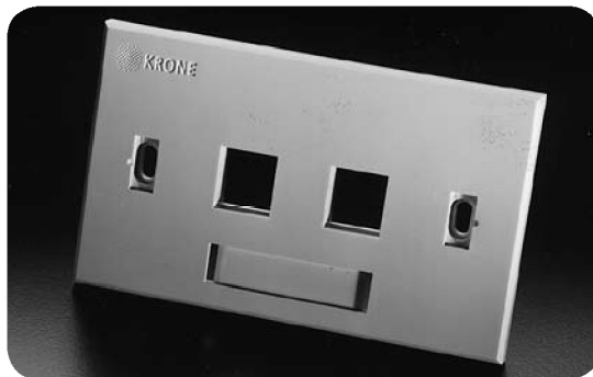
2-port horizontal faceplate