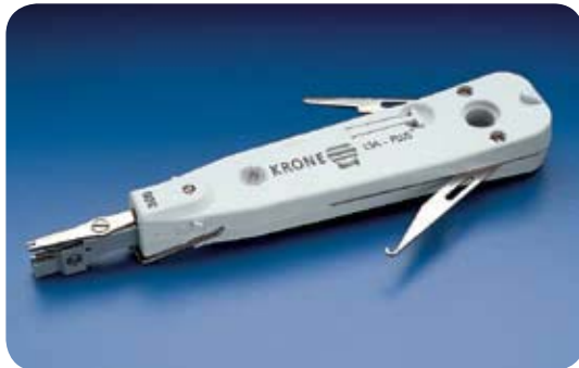
KRONE insertion tool

Inhibitor Lock Prevents the automatic trimming of excess wire to enable daisy-chaining